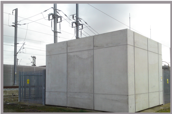
pic1. Transformer Station in London's East End

A transformer station located in London's East End was subject to flooding. This water ingress was submerging the 240,000V power lines on the floor and creating an increased level of humidity throughout the building, increasing the control panel's susceptibility to moisture damage. Suspicions were raised that the water ingress was caused by faulty seals around the cable entry gland, allowing rainfall to enter the building. As well as logging the data for download at the end of the monitoring period the client also requested real time data.